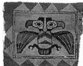
The Eagle Rug Image # PDP 01540