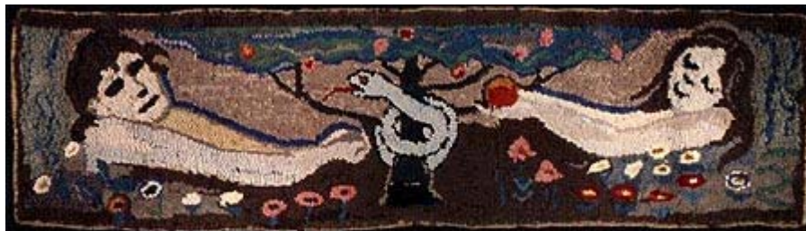
Adam and Eve - Emily Carr - Used by permission of B.C. Archives - Image # PDP 03665