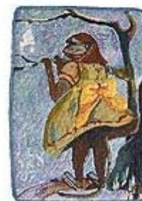
Woo Image # PDP 00603